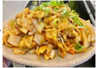
Chao Kui Tiao

(Medium) Flat rice noodles (Ho Fen) with small prawns, chicken, BBQ pork, egg, veges, Malaysian sambal belacan.