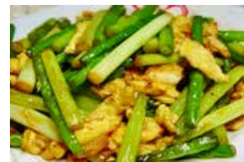
Garlic shoots & egg