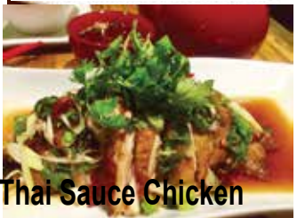
Thai Sauce Chicken

Roasted chicken, De-boned, Coriander, chilli, lime juice, palm sugar, fish sauce