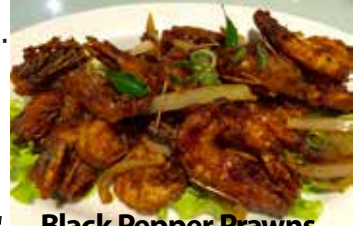
Black Pepper Prawns

(Mild) with butter, chilli, curry leaves, onion & black pepper.