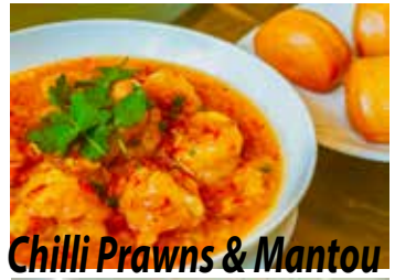
Chilli Prawns & Mantou

Recommendation: served with Mantou, which are used to scoop up the sauce.