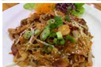
Chao Kui Tiao

Stir fry flat rice noodles (Ho Fen) with chicken, small prawns, BBQ pork, beans sprouts, veges & sambal belacan.