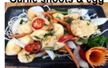
Salt & Pepper Tofu