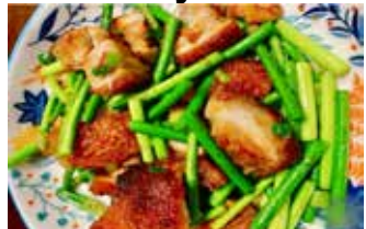
Pork Belly Garlic Shoots