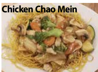
Chicken Chao Mein

Stir fry chicken, egg and vegetables, served on a bed of pan fried egg noodles.