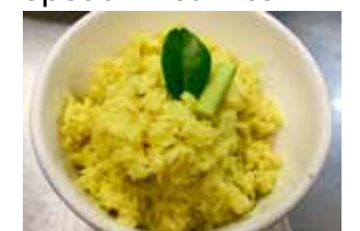
Yellow Coconut Rice

Coconut milk, turmeric, lemongrass, kaffir lime leaves.