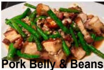
Pork Belly & Beans

Pork mince, chilli, preserved veges, ginger.