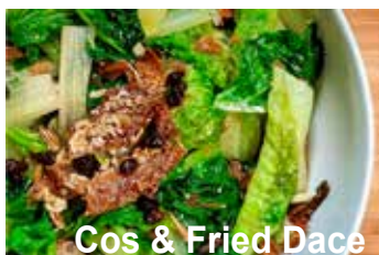
Cos & Fried Dace