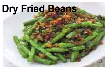
Dry Fried Beans