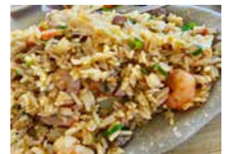
Special Fried Rice